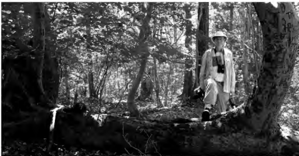
Figure 14. The author in Moore's Woods, Greenport, searching for the crane-fly orchid. Note the old, up-rooted American beech tree with fallen branches now growing into vertical "trunks;" note also the numerous carvings into the smooth, elephant-skin-like bark. Around 1990, many flowering orchids grew around the base of this fallen tree; now the colony is restricted to a very small area in Moore's Woods. [E. Lamont]

My final tally for my Long Island adventure was at least 55 plant species that I had never before seen, plus three new varieties of plant species that were otherwise familiar to me, and two new species of dragonflies. I had made a fleeting trip to Long Island in July 2010 to see a Cyndi Lauper concert with a friend, but we didn't have much opportunity to botanize on that trip, and I certainly didn't have the benefit of a knowledgeable, enthusiastic and generous guide like Eric. Thanks to Eric and Mary Laura for their wonderful hospitality and for whetting my appetite for the flora of Long Island.